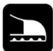
Abrasion Resistant Sole