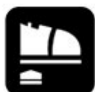
Heel Energy Absorption