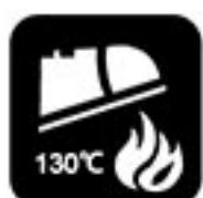
Heat Resistant Sole 130°C