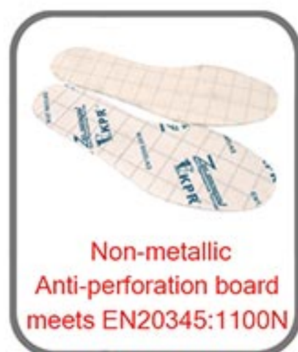
Non-metallic Anti-perforation board meets EN20345:1100N