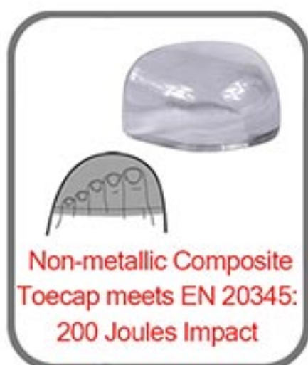
Non-metallic Composite Toecap meets EN 20345: 200 Joules Impact